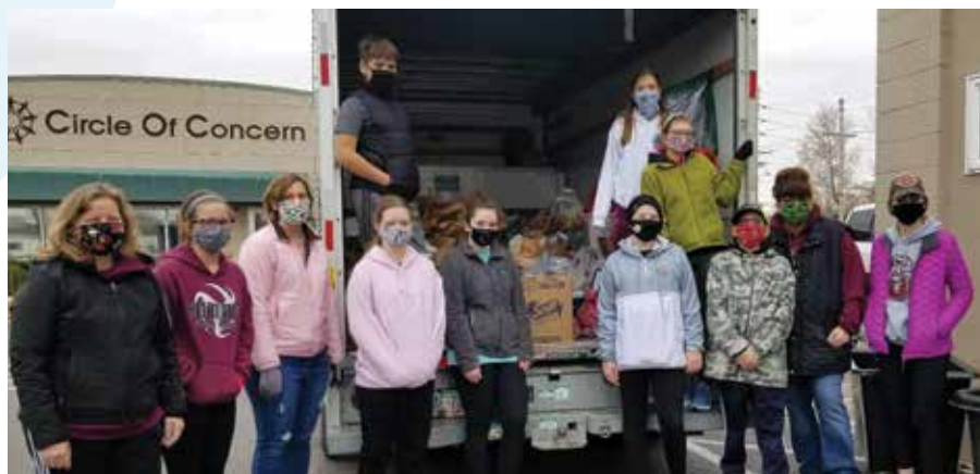
Above: Girl Scouts stepped up to collect food when other food drives were cancelled.