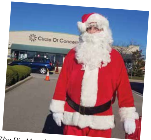
The Big Man, himself, checked out Circle's Holiday Adoption distribution event for clients!