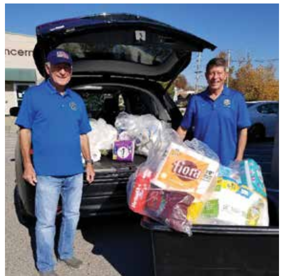
West County Rotary members collect daily essentials for Circle.