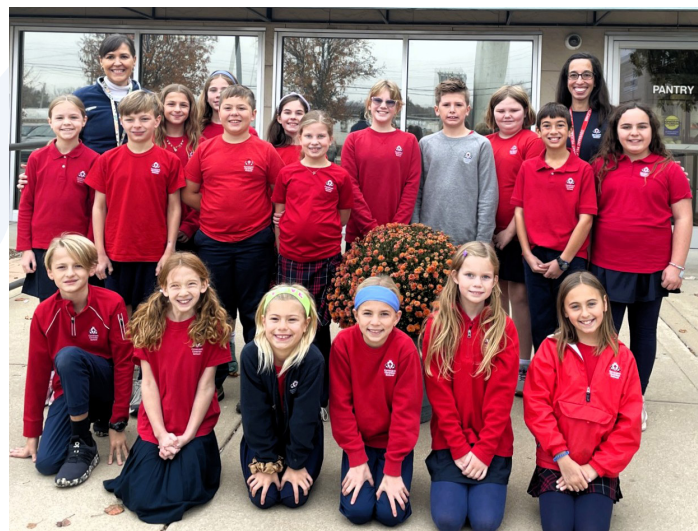
Students from Covenant Christian School stopped by to donate 880 pounds of food!